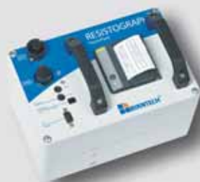
PowerPack (contains battery pack, printer and data memory)