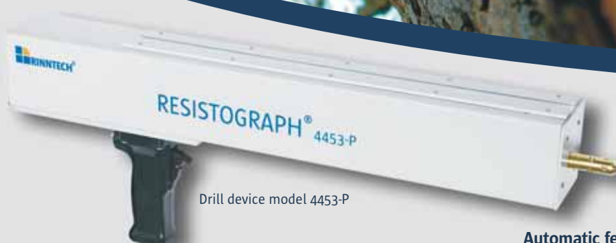
Drill device model 4453-P